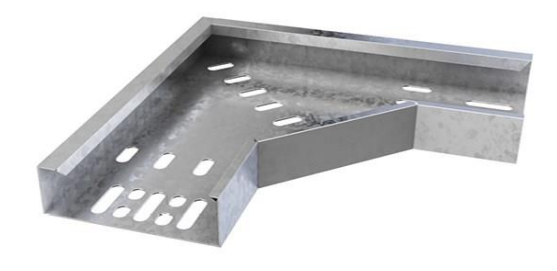
Illustration shown is medium dut